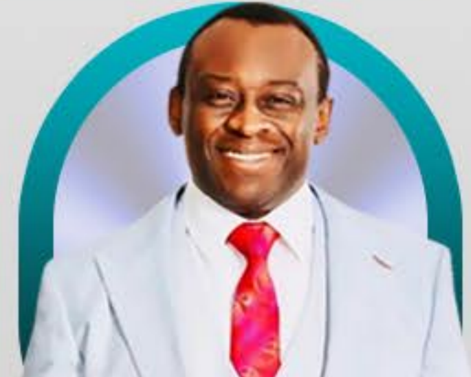
HIGHLY ESTEEMED PASTOR CHUKA IBEACHUM CHRIST EMBASSY WESTERN EUROPE ZONE 4