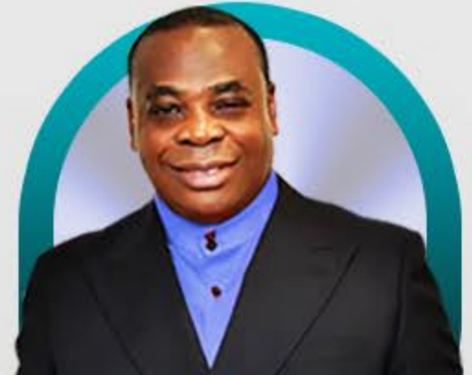
HIGHLY ESTEEMED PASTOR VICTOR UBA CHRIST EMBASSY WESTERN EUROPE ZONE 2