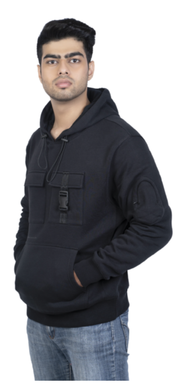
Men's Buckle Sweat Fabric: 80/20 Cotton/Poly Brushed Back with Bio Polish 320 GSM