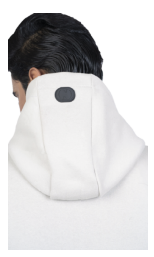
Men's Color OH Hoodie with Raised Print Fabric: 80/20 Cotton/Poly Brushed Back With Bio Polish 320 GSM