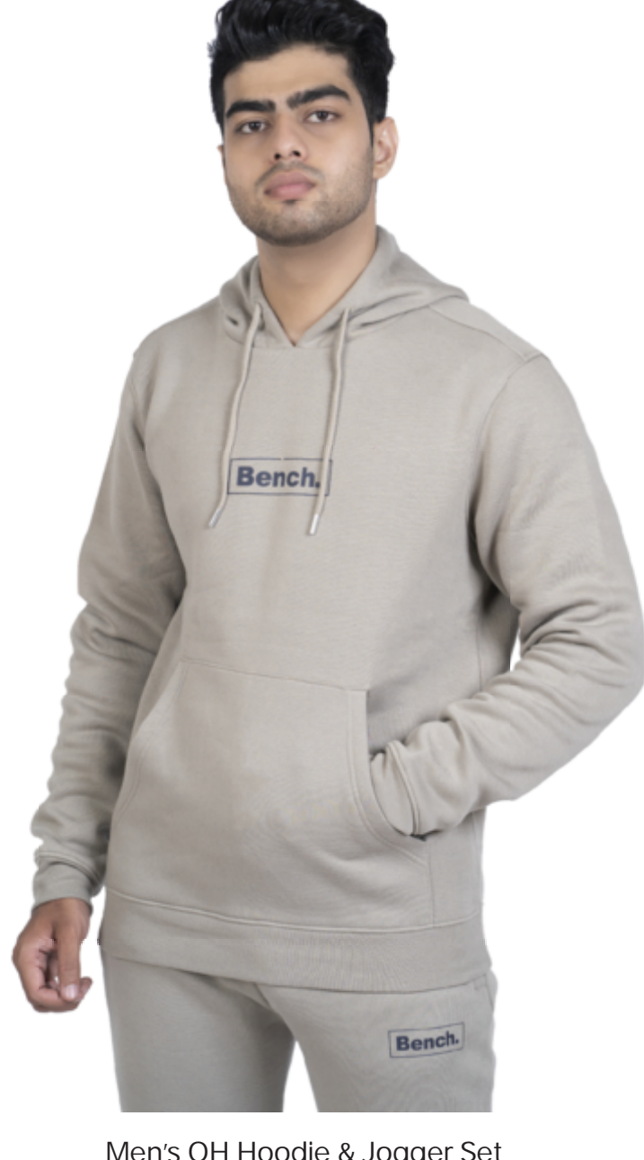
Men's OH Hoodie & Jogger Set Fabric: 60/40 Organic Cotton/Recycled Poly Brushed Back 280 GSM